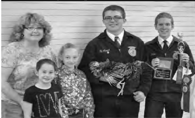
Northwest Medical Management