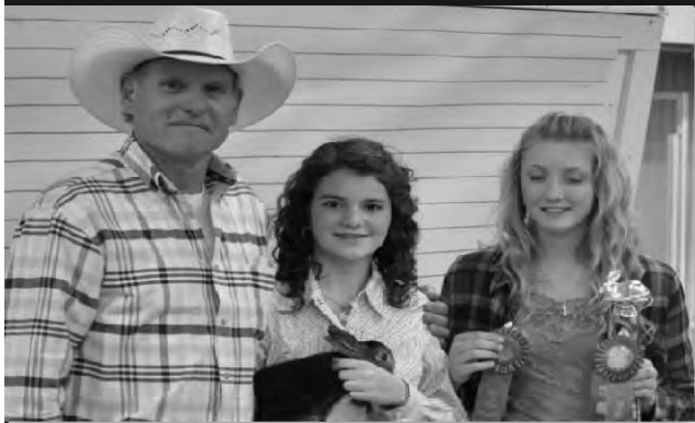
Rocky Ridge Land & Cattle