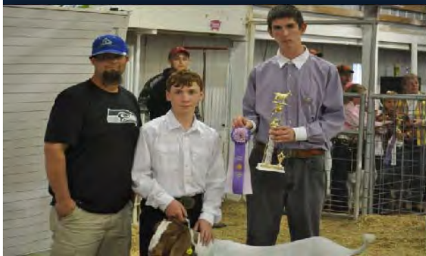
Dan Anderson Construction