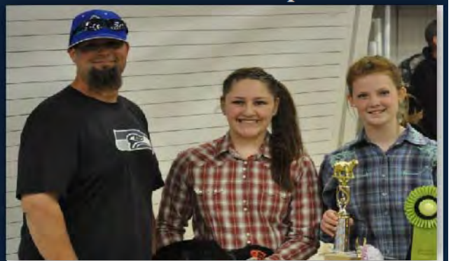
Dan Anderson Construction