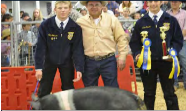
Lewiston Livestock Market