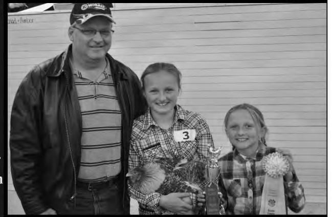
Jeff Schacher Construction