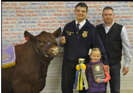
Idaho Forest Group