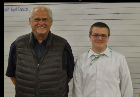
Happy Day Corp.