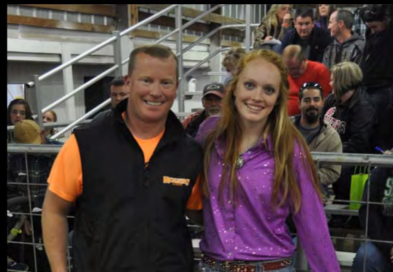
Roger's Toyota Scion