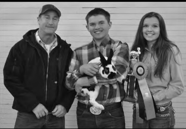
Early Bird Supply

You may pay for the animal at the sale office or a billing will be sent. Current interest rate to be charged 30 days after billing. 1% pencil shrink on Lambs - 3% pencil shrink on Steers. No shrink on Hogs or Goats.