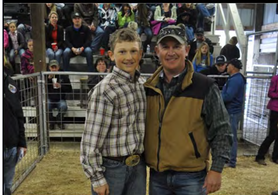
Hell's Canvon Electric