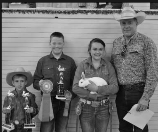
Lewis Clark Terminal