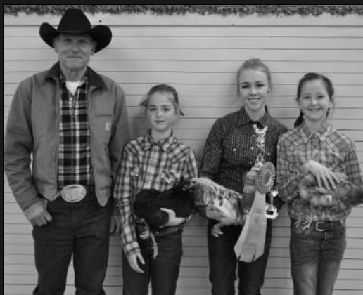
Rocky Ridge Land & Cattle